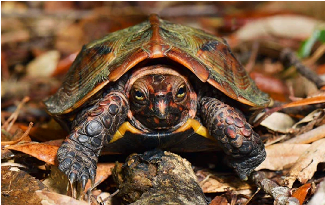
Ryukyu Leaf Turtle (Geoemyda japonica)

I'd definitely recommend trying to visit Yanbaru if you get the chance. There are lots of flights to Okinawa, where you can easily hire a car, drive a couple of hours north to the National Park, and encounter a whole host of animals you'll never see anywhere else in the world.