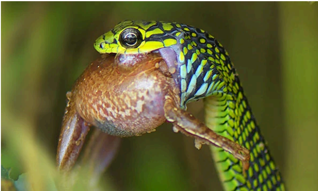
Boomslang eating a frog in Queen Elizabeth National Park