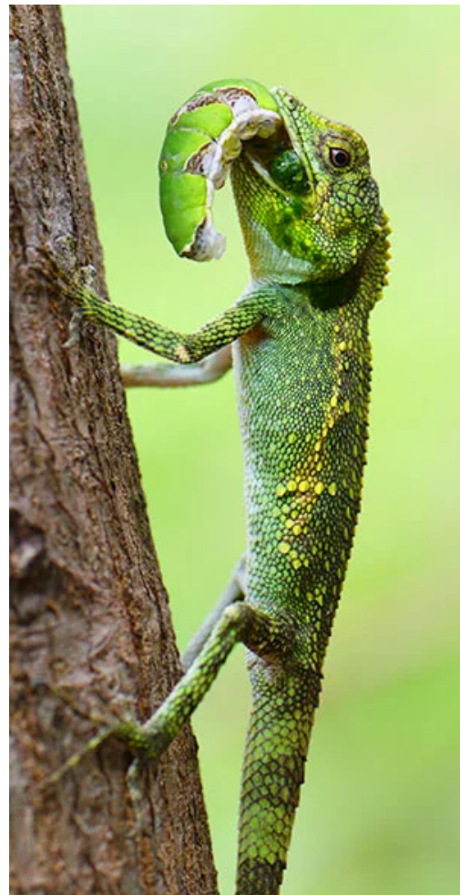
Ryukyu Japalure eating a caterpillar

Most famous for the American air base and fighting that took place there during the Second World War, Okinawa is actually a very special place for wildlife... with an impressive range of insects, amphibians, reptiles and birds. Many species like the extremely rare Okinawa Rail and Okinawa Woodpecker are found nowhere else in the world.